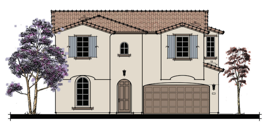
*Picture is for conceptual purposes and does not include actual elevation, color, garage and driveway position.

4 BEDROOM | 3 BATH | 3 CAR TANDEM GARAGE | 2,254 SQFT